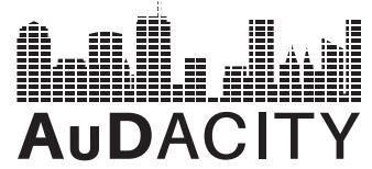
Exhibit Contract & Sponsorship Agreement

Please complete all sections of this application.