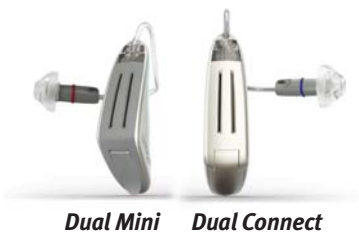
Dual Mini Dual Connect

For more information please call 1-800-526-3921 or visit - www.oticonusa.com